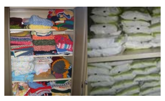
Banks of clothes and nutritionally enhanced food at FCC are leveraged from faith-based groups and the Department of Health, respectively. The clothes and food are distributed to needy families following needs assessments by the volunteers.