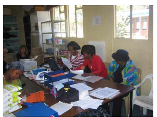
Isolabantwana volunteers meet with the M&E assistant to submit their data records. The meetings also serve as a platform for feedback, mentorship and support

The HIV project recognizes staff and volunteers and allows them to creatively participate in the running of the project. Information days are held to educate the community about the project's activities and services. The project has also been successful in the establishment of user-friendly data management system and encouraging the active involvement of HIV-positive people in the HIV project.